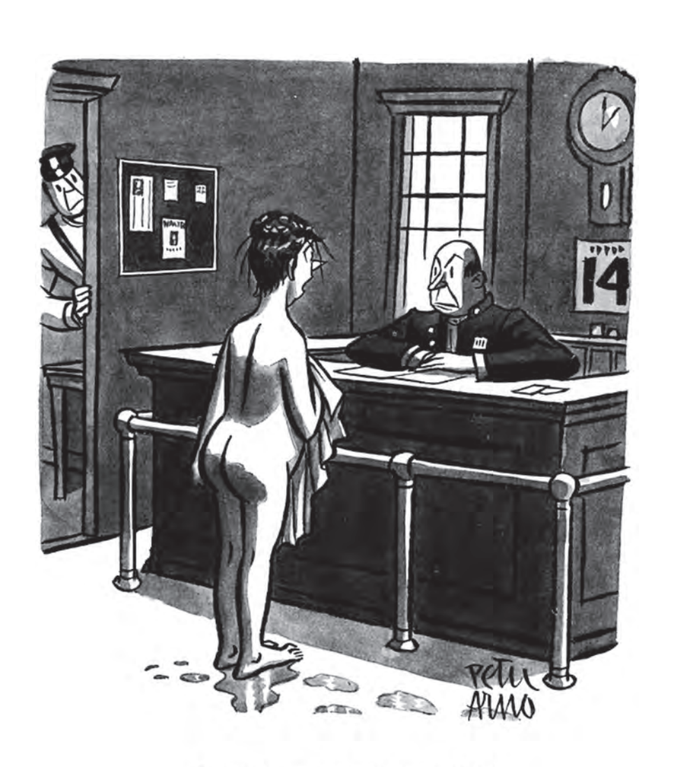
I want to report a stolen bathtub.