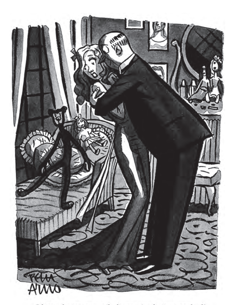
I have the strangest feeling we're being watched!